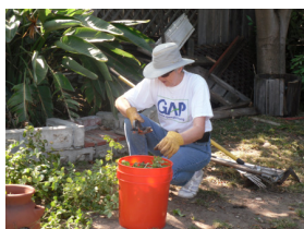
More gardening . . .