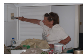
Discovering Very Old Wallpaper at the Parsonage