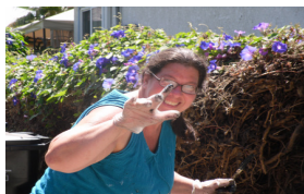
Painting the Gate at the Parsonage—Messy!