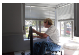
Sitting in the Sink Fixing a Window at the Parsonage

Sunday morning worship at 9:30 a.m. First Sunday of the Month at 6:30 p.m.— The Gathering—an Evening of Sacred Song & Prayer First Tuesday of the Month at 7:00 p.m. - Health Rhythms Drum Circle— free - adults only